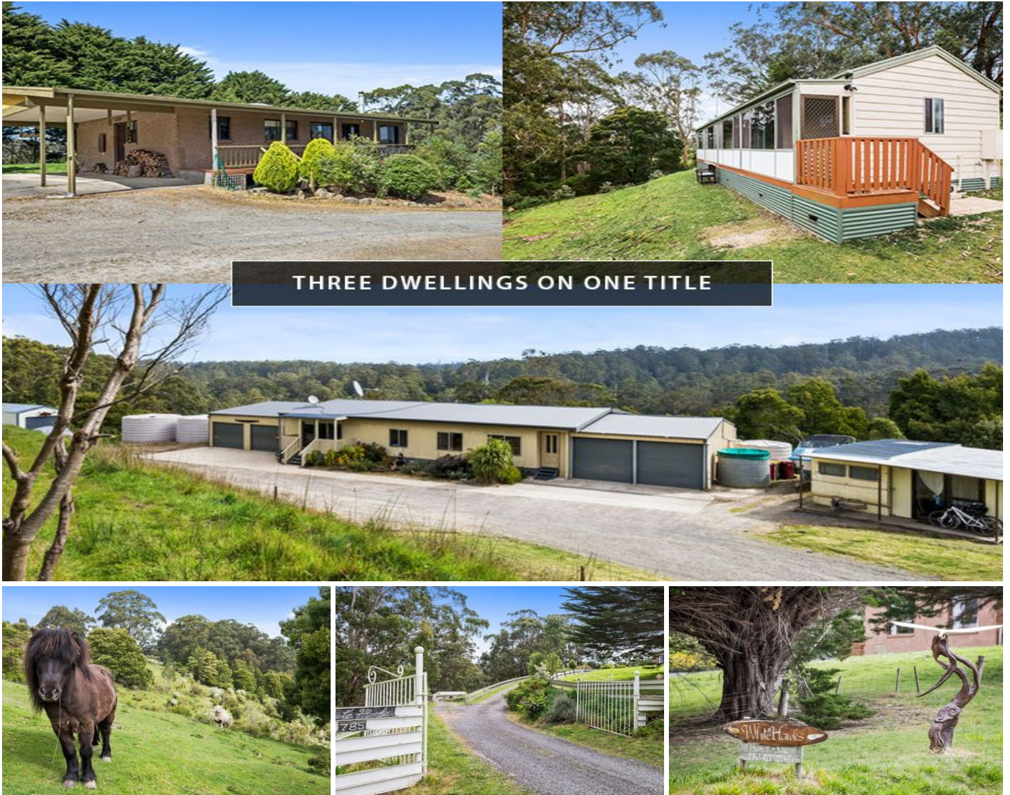
THREE DWELLINGS ON ONE TITLE