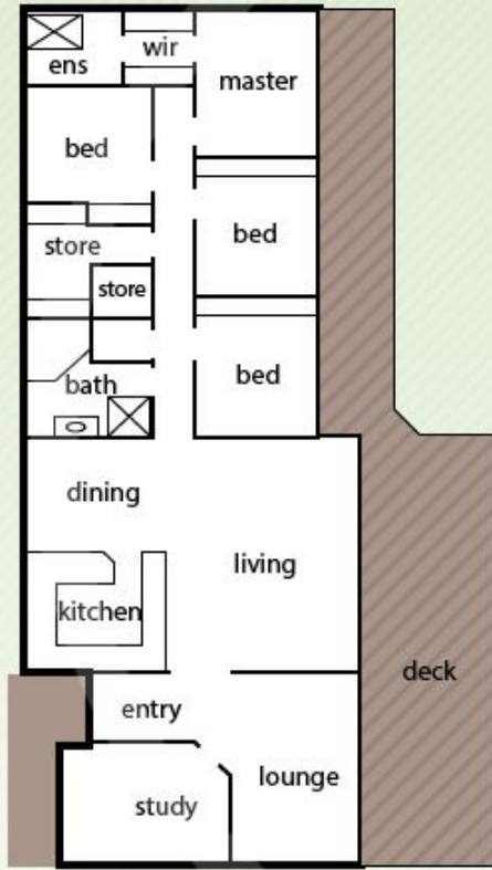
upper floor - main house