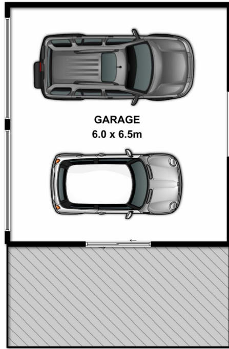
garage not in position