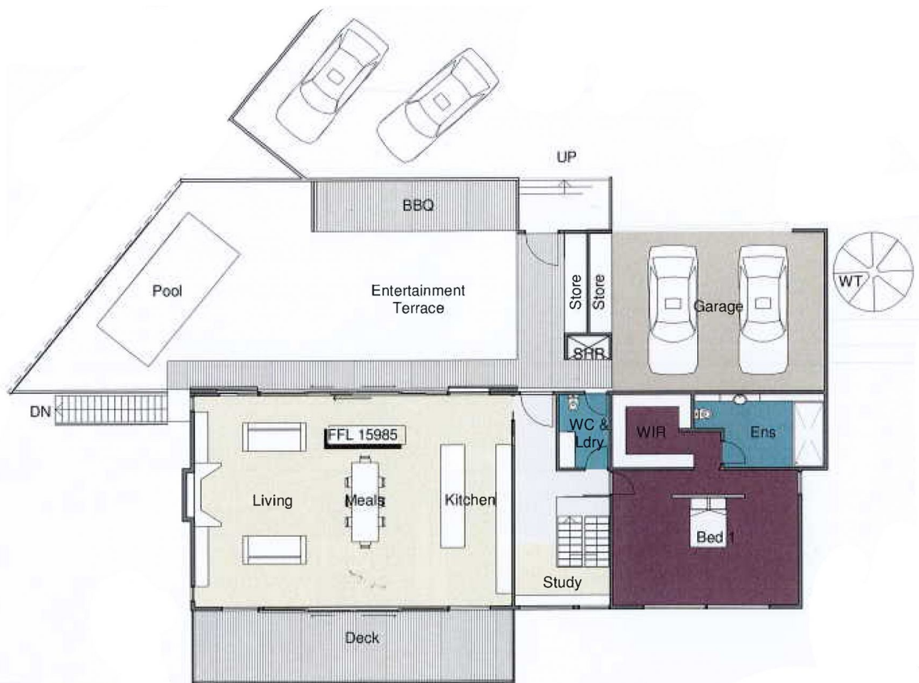
upper floor plan