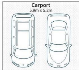
( Not In Position )