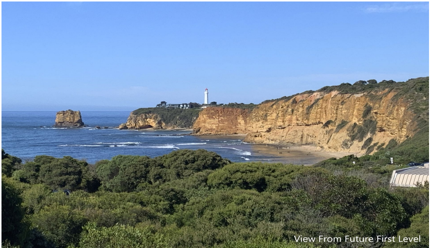
View From Future First Level